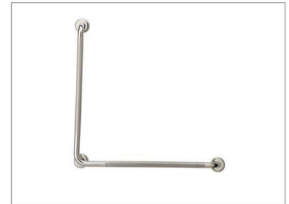
"L" Safety Support