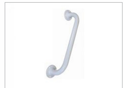
Vertical & Horizontal Safety Support

FasTTrak support bar system is an adaptable tube and connector system that facilitates productive custom-made design for support bars, guide railing and staircases where vertical post fixing is essential. Available in both left and right handed version with plugs and screws.