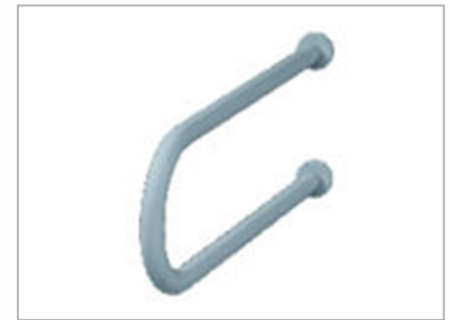
Basin Guard Rail